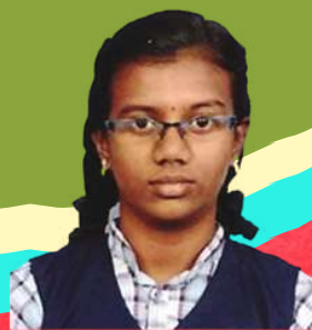
S B Kavyashree Perundurai Medical College