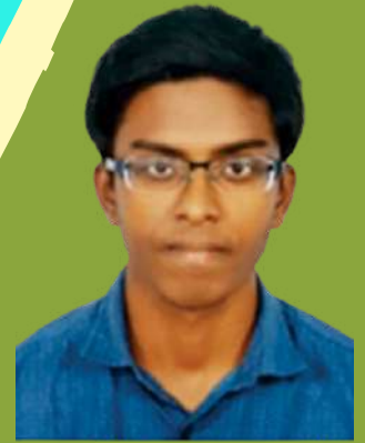
Navaneethan Adithyaraj Coimbatore Medical College