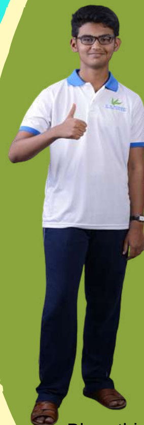
Bharathi Madras Medical College